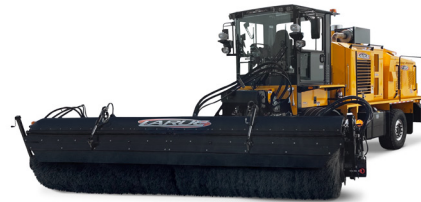
FB18 | FB20 | FB22