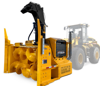
D30 | D40 | D50 | D60