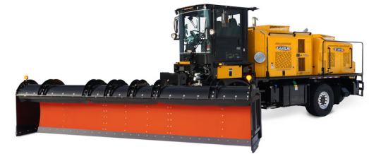
FP18 | FP20 | FP22