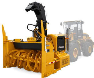
D25 | D35 | D45 | D55 | D65