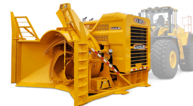
D87 | D97